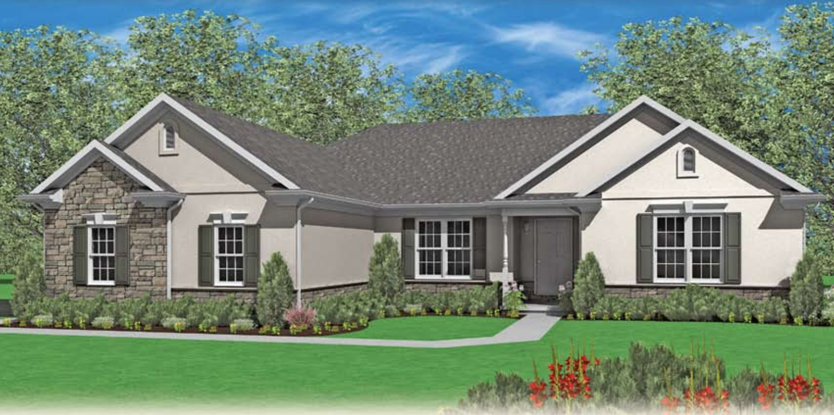
Elevation A3 AS-A-OR-1421

Shown with optional: Side load garage, hip roofs