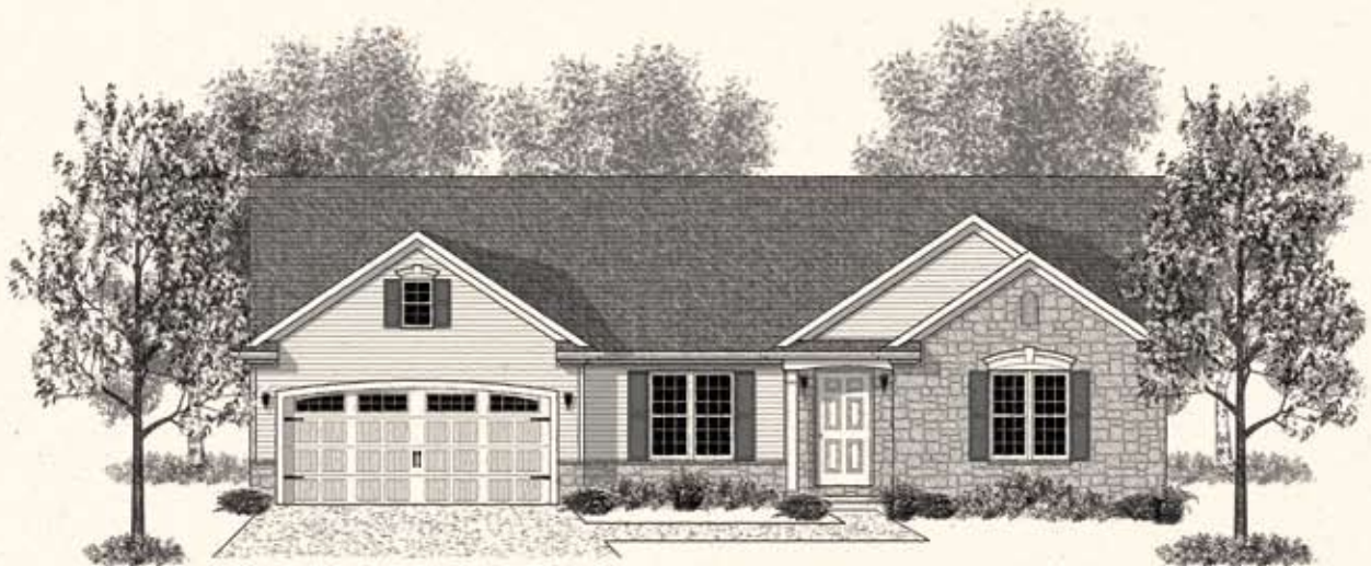
Elevation A2 AS-A-OR-1421

Shown with optional: Side load garage, hip roofs