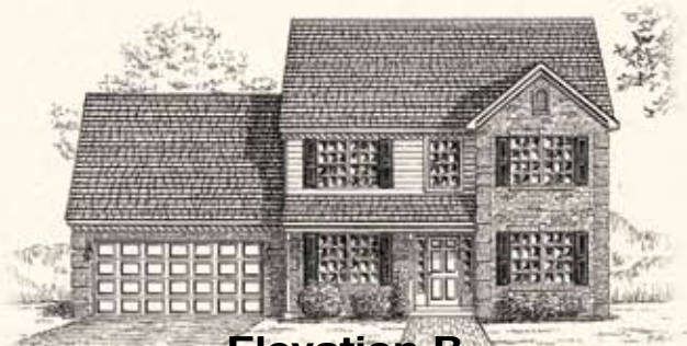
Elevation B BB-B-OR-0552

Shown with optional: Bonus room over garage, standing seam porch roof, stone wainscoting, garage door trim and front entrance sidelights