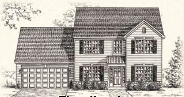
Elevation A BB-A-OR-0551

Shown with optional: Standing seam porch roof, garage door trim and front entrance sidelights