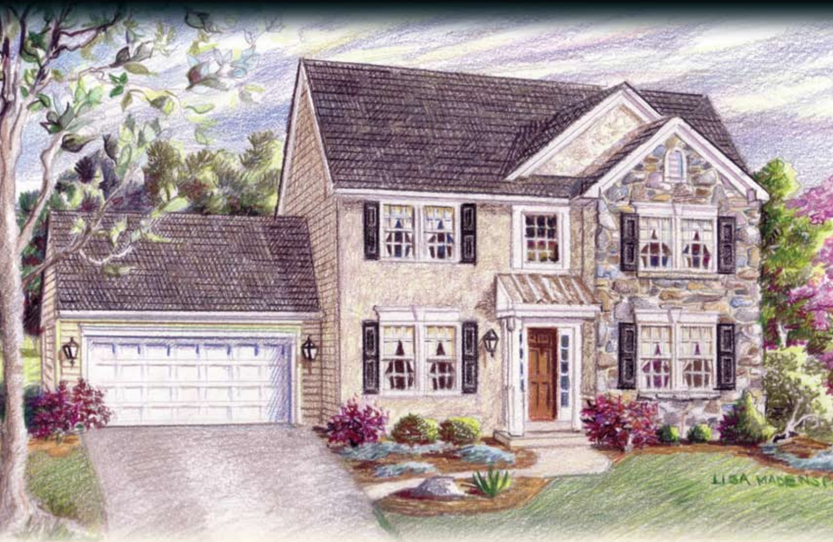
Elevation C BB-C-OR-0553

Shown with optional: Standing seam porch roof, garage door trim and front entrance sidelights