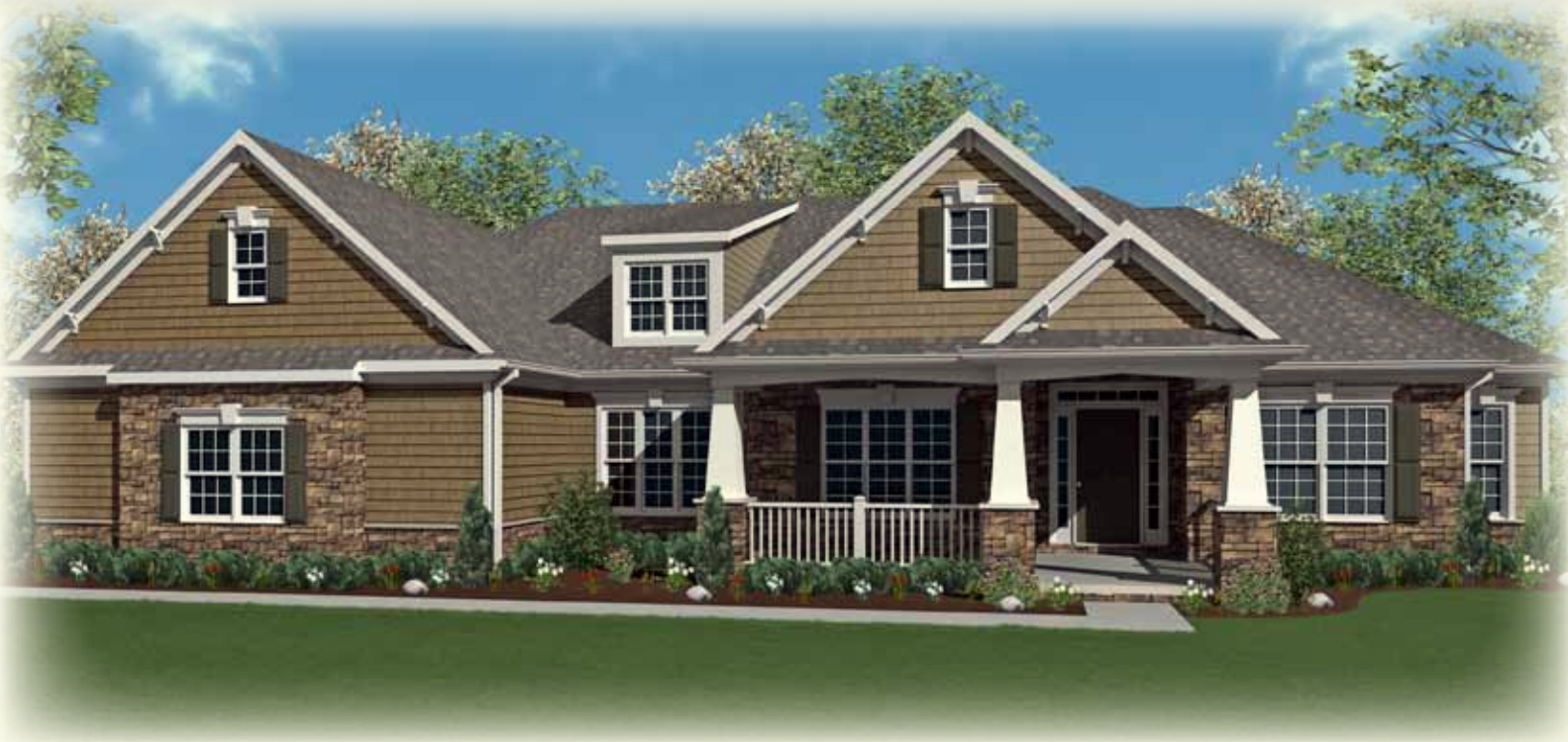
Elevation C BG-C-OR-1543

Shown with optional: 9 foot first floor wall height, side load garage, garage & main house gable windows, front door transom, double shed dormer, decorative gable brackets, cedar siding ILO standard siding, porch railing, arched porch beam