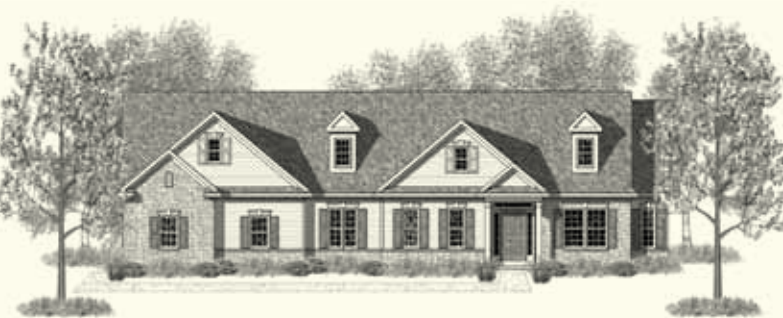
Elevation A BG-A-OR-1541

Shown with optional: 9 foot first floor wall height, side load garage, garage & main house gable windows, front door transom, double shed dormer, decorative gable brackets, cedar siding ILO standard siding, porch railing, arched porch beam