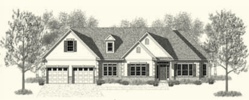
Elevation B BG-B-OR-1542

Shown with optional: 9 foot first floor wall height, 2 dormers, side load garage, garage & main house gable windows, front door transom