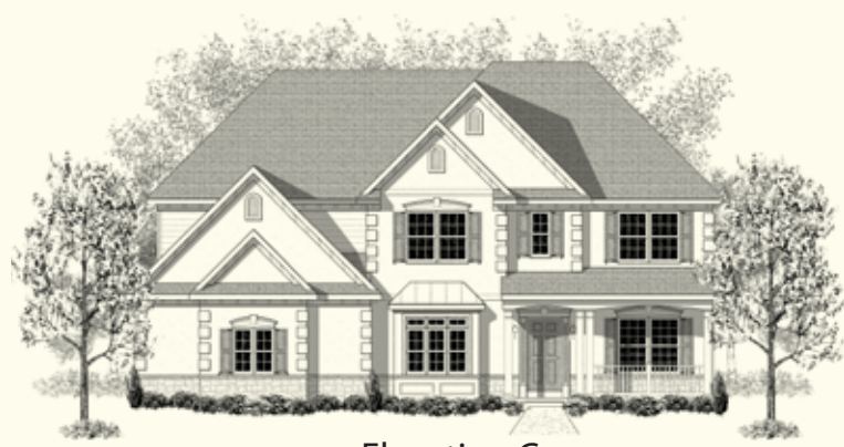
Elevation C EL-C-OR-1743

Shown with optional: 9 foot first floor wall height, standing seam metal roof and pent eaves on porch and garage pent roof, decorative gable brackets, 3 dormers, side load garage, garage gable window, porch railing, transom above front door