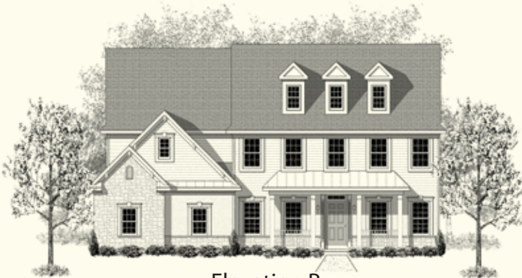
Elevation B EL-B-OR-1742

Shown with optional: 9 foot first floor wall height, standing seam metal porch roof and pent eaves, metal roof on garage pent roof, decorative gable and eave brackets, shed dormer with optional metal roof, side load garage, box bay bump-out front of garage with false window shutters, garage gable window, shutter dogs & hinges, 8" porch box columns with brackets, porch railing.