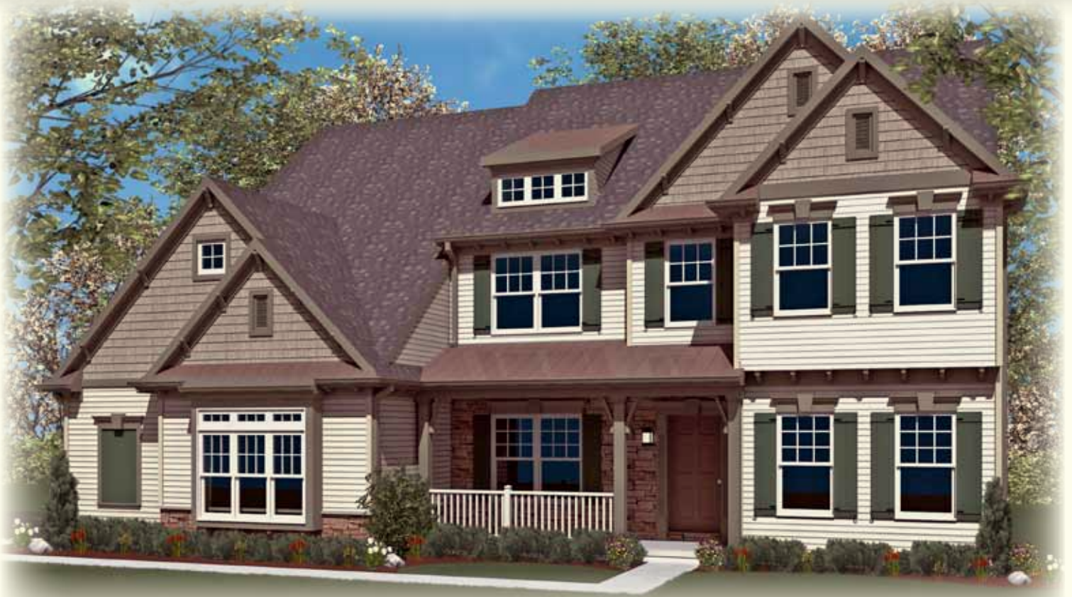
Elevation A EL-A-OR-1741

Shown with optional: 9 foot first floor wall height, standing seam metal porch roof and pent eaves, metal roof on garage pent roof, decorative gable and eave brackets, shed dormer with optional metal roof, side load garage, box bay bump-out front of garage with false window shutters, garage gable window, shutter dogs & hinges, 8" porch box columns with brackets, porch railing.