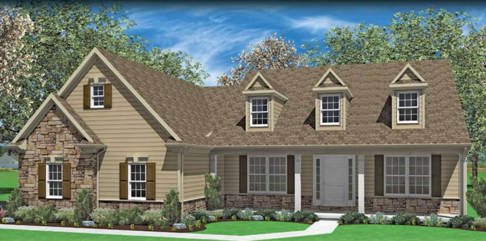
Elevation A2 FM-A-OR-1451

Shown with optional: Side load garage, garage gable window, 3 dormers, front door sidelites, arched porch beams, 8" square front porch posts