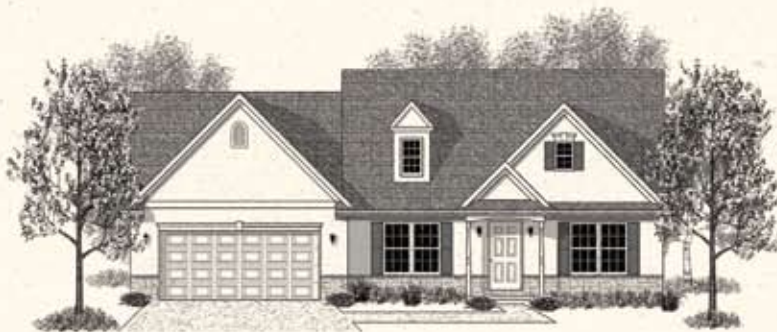
Elevation B3 FM-B-OR-1452

Shown with optional: Side load garage, garage gable window, 3 dormers, front door sidelites, arched porch beams, 8" square front porch posts