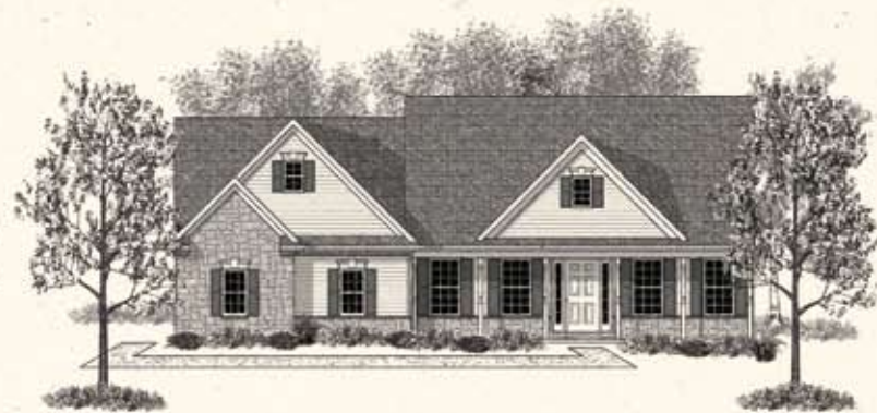
Elevation C2 FM-C-OR-1453

Shown with optional: Main house gable window, single dormer, arched porch beam