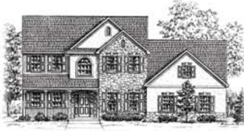
Elevation C LE-C-OR-0383

Shown with optional: 8" porch columns and copper roof