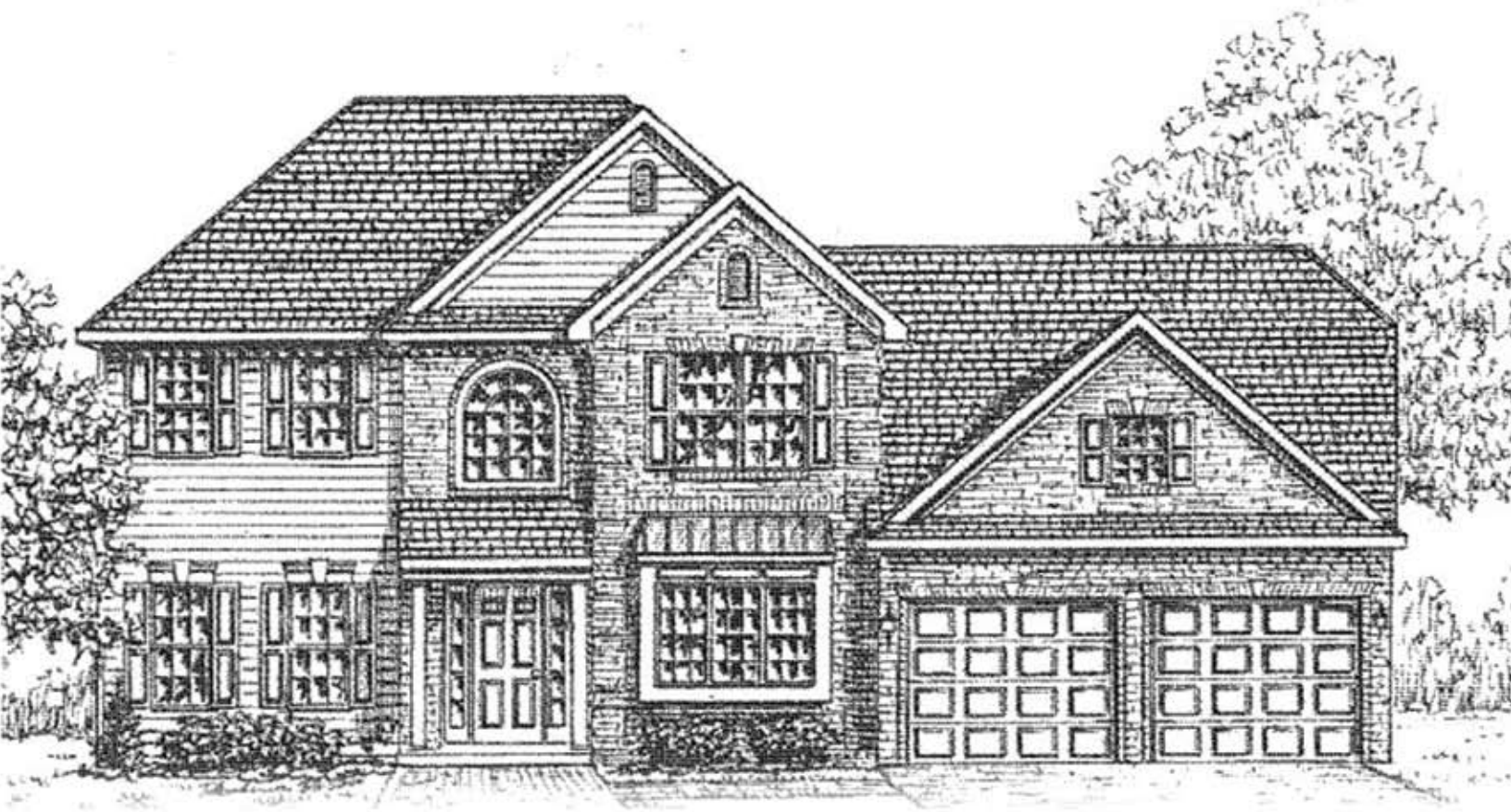
Elevation B LE-B-OR-0382

Shown with optional: 8" porch columns, copper roof and hip roof