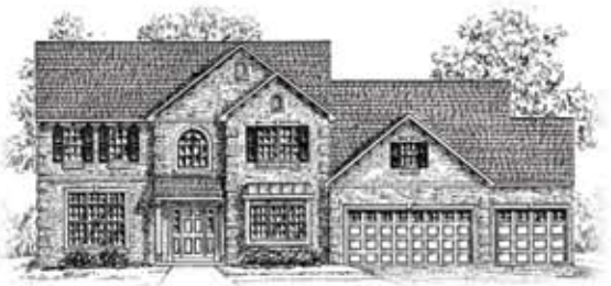
Elevation D LE-D-OR-0384

Shown with optional: Porch railing and side load garage