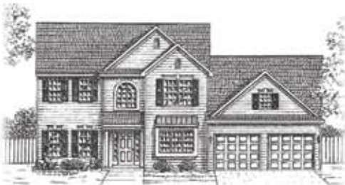
Elevation A LE-A-OR-0381

Shown with optional: 8" porch columns, copper roof and hip roof