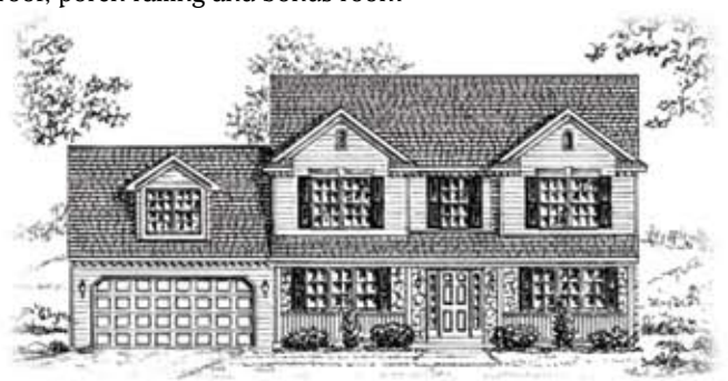
Elevation B RF-B-OR-0422

Shown with optional: Two small dormers and bonus room