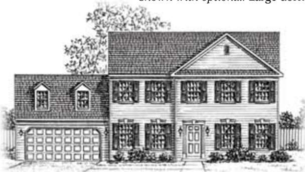
Elevation A RF-A-OR-0421

Shown with optional: Large dormer, copper roof, porch railing and bonus room