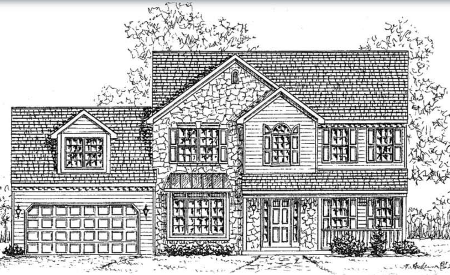
Elevation C RF-C-OR-0423

Shown with optional: Large dormer, copper roof, porch railing and bonus room