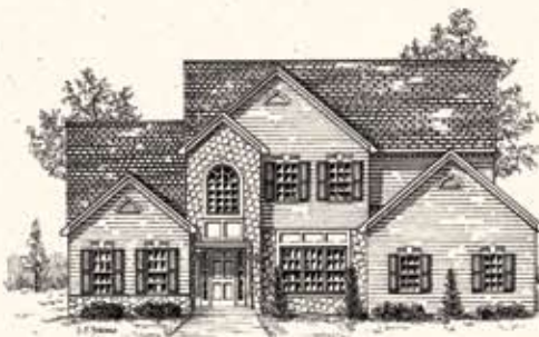
Elevation A ST-A-OR-0431

Shown with optional: Gable windows and 3-car garage