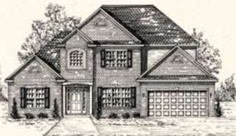
Elevation C ST-C-OR-0433

Shown with optional: Hip roof and 8" round columns with arch