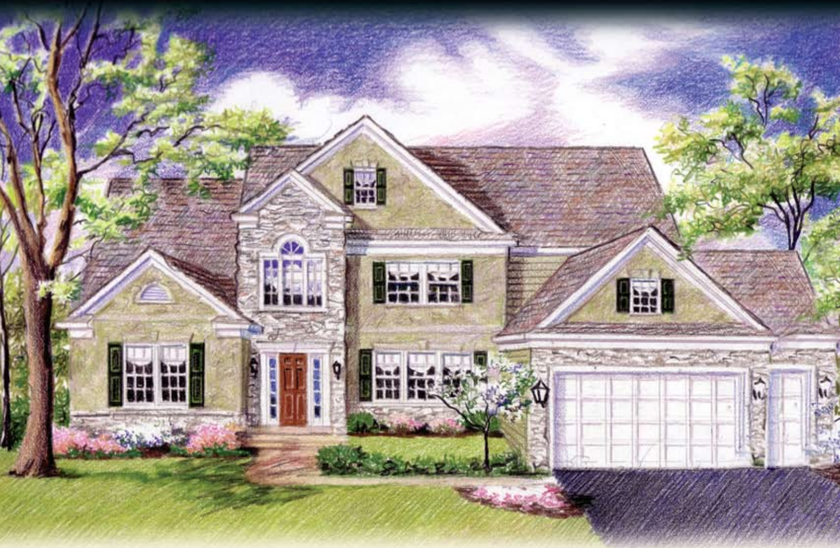
Elevation B ST-B-OR-0432

Shown with optional: Gable windows and 3-car garage