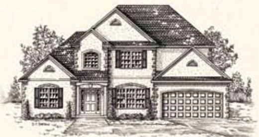
Elevation D ST-D-OR-0434

Shown with optional: Hip roof and 8" round columns with arch