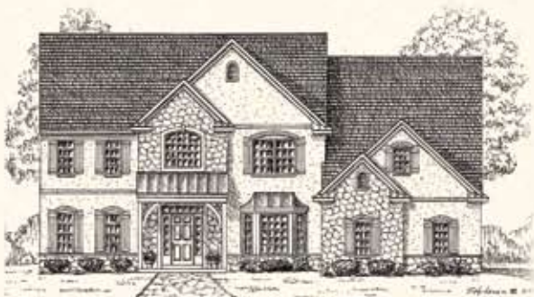
Elevation B SF-B-OR-0852

Shown with optional: Hip roof, side load garage, bay window with copper roof, transom over front door, 9' first floor ceilings and 3-car garage