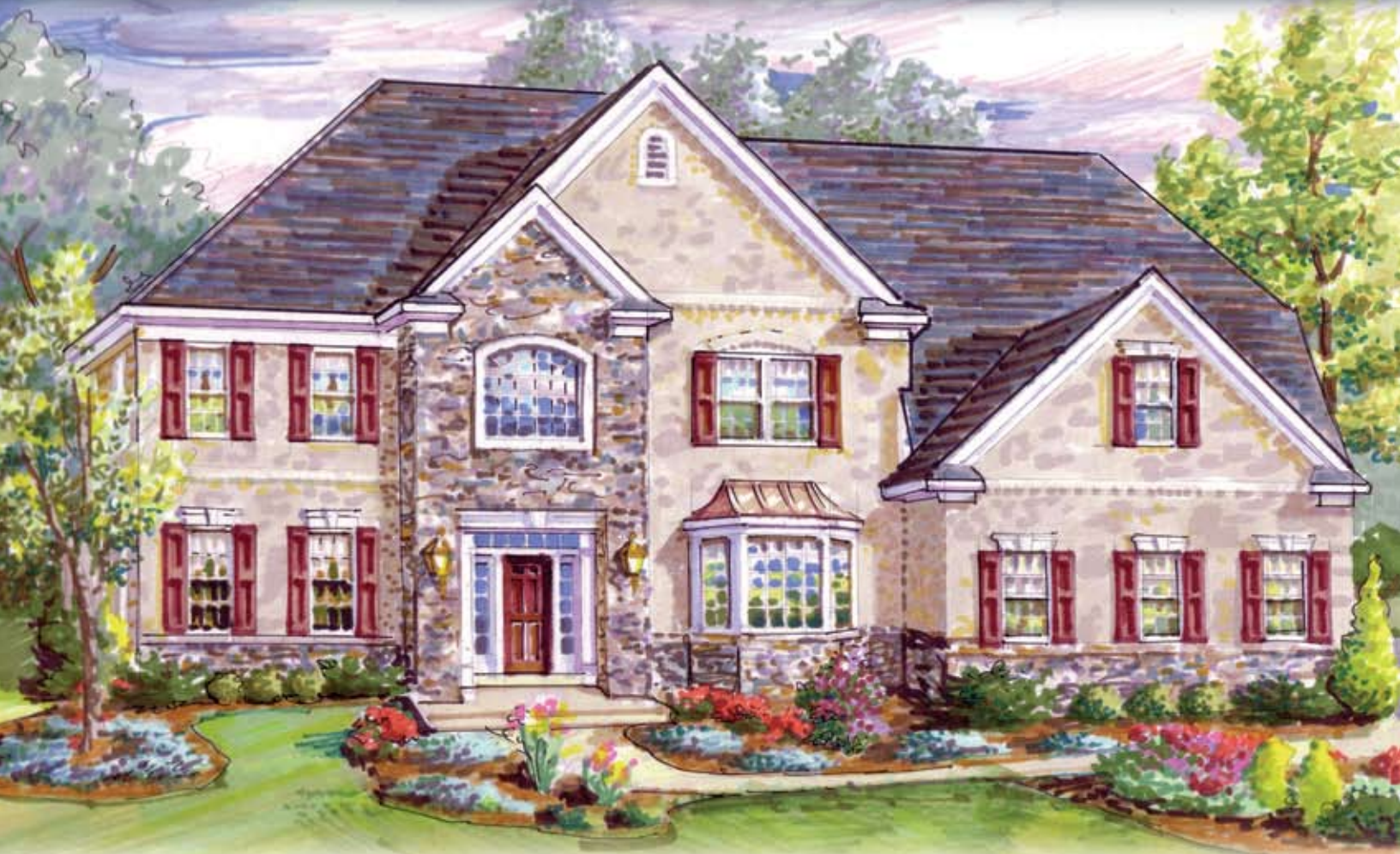
Elevation A SF-A-OR-0851

Shown with optional: Hip roof, side load garage, bay window with copper roof, transom over front door, 9' first floor ceilings and 3-car garage