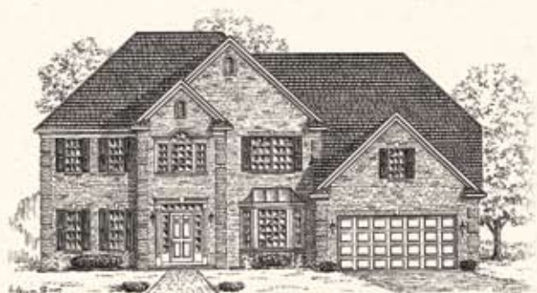
Elevation C SF-C-OR-0853

Shown with optional: Side load garage, bay window and porch copper roof, transom over front door, 9' first floor ceilings and 3-car garage