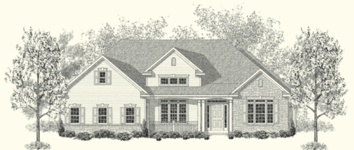
Elevation B TY-B-OR-1532

Shown with optional: 9 foot ceilings, 2 dormers, board and batten shutters, shutter dogs and hinges, porch railing, transom above front door, arch porch beam, cedar siding ILO standard (front of home only)