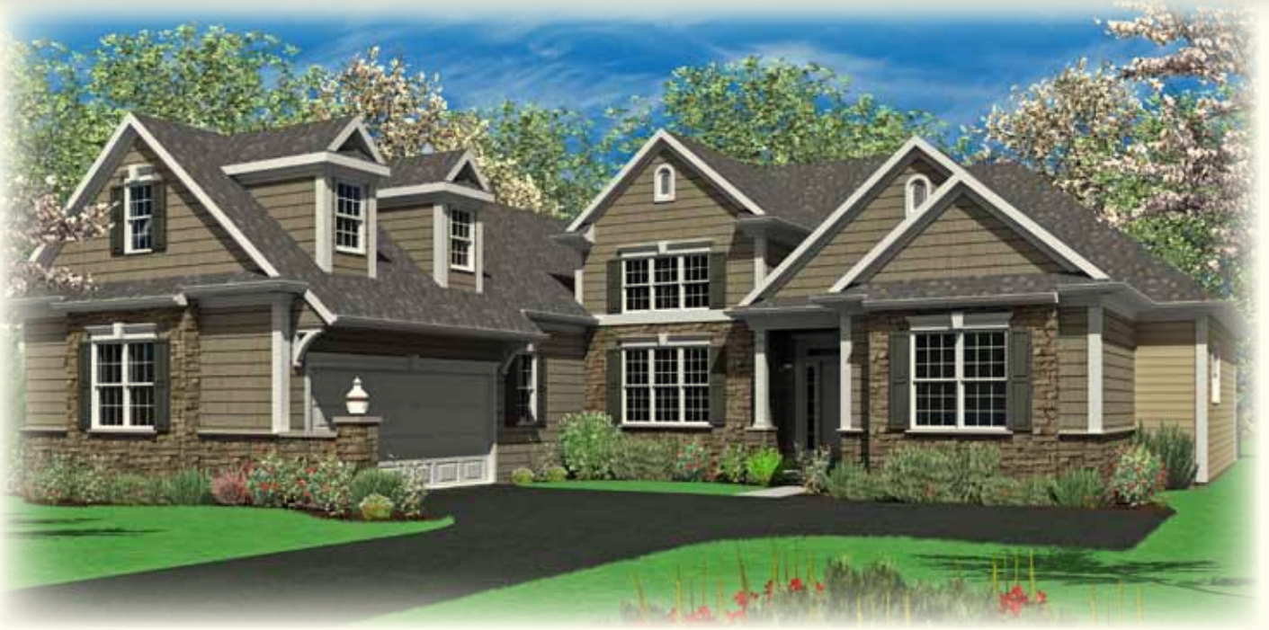
Elevation C TY-C-OR-1533

Shown with optional: 9 foot ceilings, transom above front door, cedar siding ILO standard siding (front of home only), courtyard wall W/ light, extended shed roof W/ decorative brackets above garage door, unfinished bonus room above garage, garage gable window, 2 garage dormers