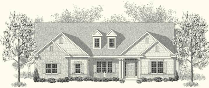
Elevation A TY-A-OR-1531

Shown with optional: 9 foot ceilings, transom above front door, cedar siding ILO standard siding (front of home only), courtyard wall W/ light, extended shed roof W/ decorative brackets above garage door, unfinished bonus room above garage, garage gable window, 2 garage dormers