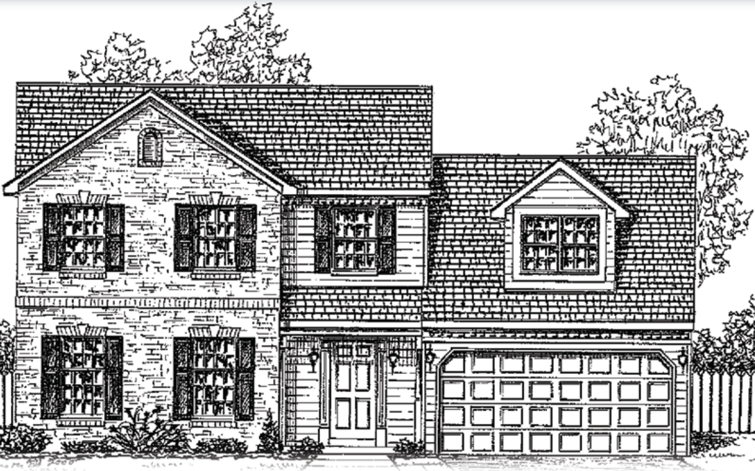
Elevation B W2-B-OR-0912

Shown with optional: Bonus room with large dormer