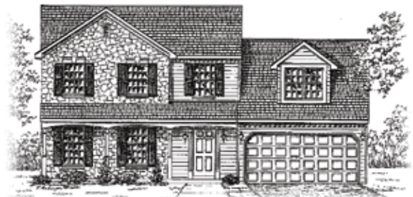
Elevation C W2-C-OR-0913

Shown with optional: Bonus room with large dormer