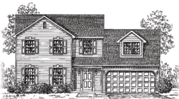
Elevation A W2-A-OR-0911

Shown with optional: Bonus room with large dormer